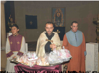
of St. Sarkis the Captain, the patron saint of the Samtskhe-Javakheti region, on the 15th of October in the city of Samtskhe-Javakheti.