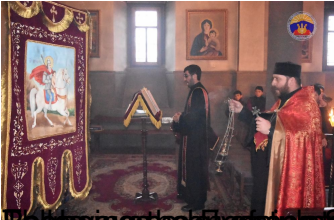
Following a long and glorious tradition, the Holy Synod of the Church in the Republic of Georgia has decided to celebrate the feast of