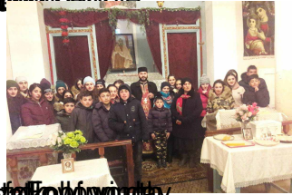
of the feast of St. Sarkis the Captain, the patron saint of the Samtskhe-Javakheti region, on the 15th of October in the city of Samtskhe-Javakheti.